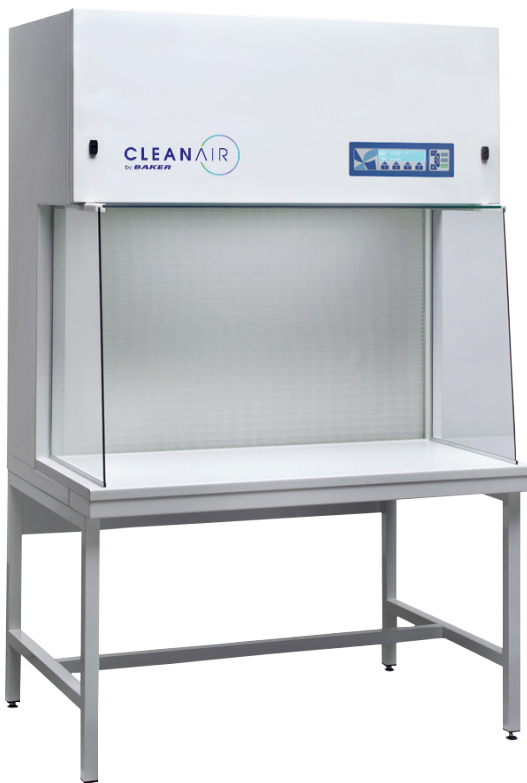
Crossflow 475 EC

CLF Series is standard available in sizes 4, 5 and 6 ft width (120, 150 and 180 cm).