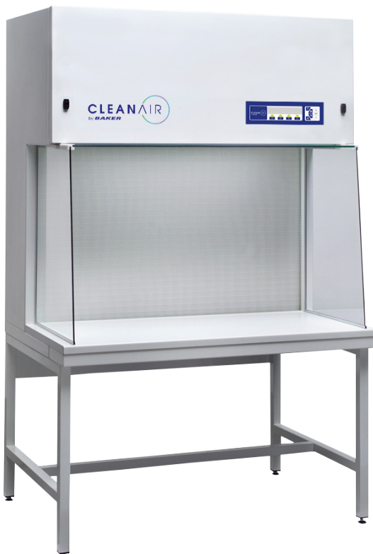
Crossflow 475 EC

CLF Series is standard available in sizes 4, 5 and 6 ft width (120, 150 and 180 cm).